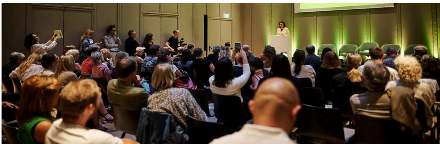
Alma Zadic, Austrian Minister of Justice at VCT STATEMENT 2023

Two panel discussions as part of VCT STATEMENT, in cooperation with ERSTE Foundation, bring to the forefront voices leading the fight against climate change and responsible resource use